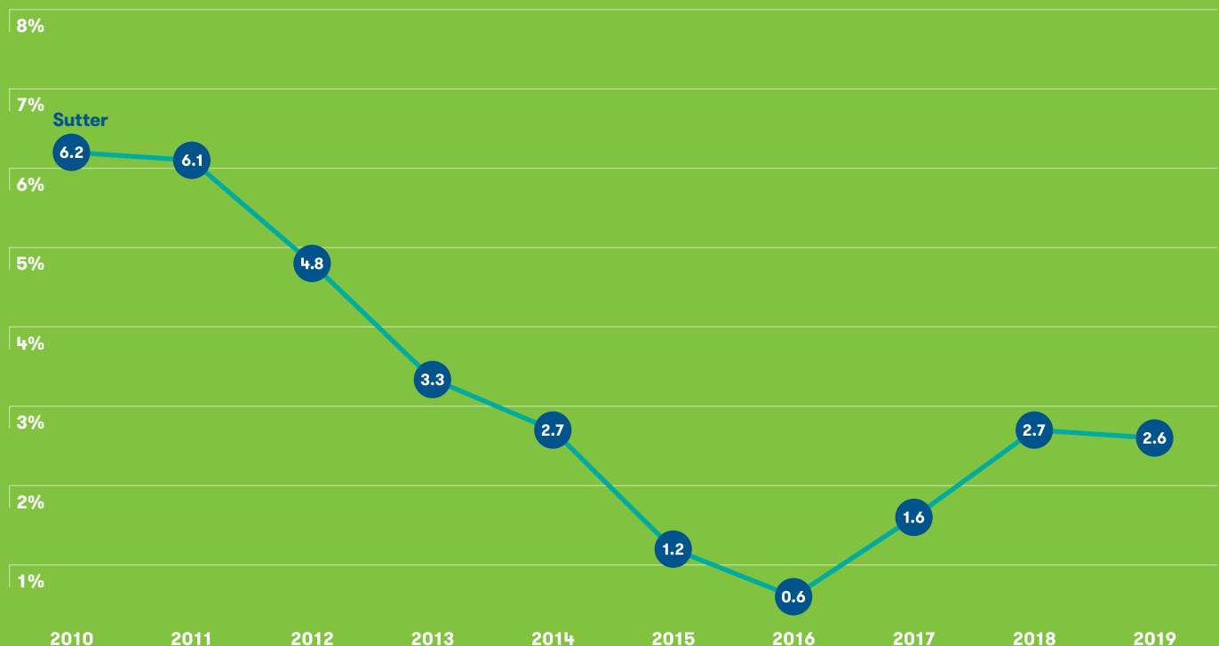
SUTTER HEALTH'S HISTORICAL COMMERCIAL PRICING INCREASES HELD TO LOW SINGLE DIGITS

Because of its integrated network, Sutter is able to heavily reinvest in the communities it serves, extending its total investment to nearly $10 billion in new facilities and lifesaving technology. This includes recently building new hospitals to expand access and comply with state-mandated seismic requirements. Further, Sutter's ability to plan for and upgrade many of its smaller hospitals depends on the stability and soundness of Sutter's integrated network.